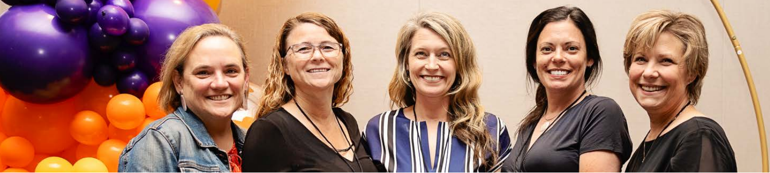
The Arc Tennessee Agency of Distinction Award winner, the Down Syndrome Association of Middle Tennessee