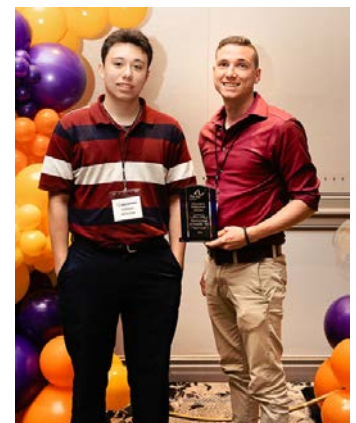
PriceLess Foods of Crossville - IGA

The Arc TN Inclusive Employer Award Winner