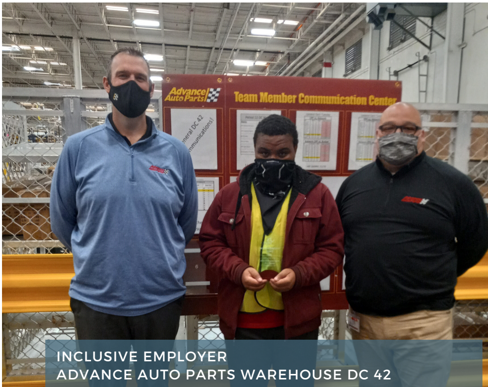
INCLUSIVE EMPLOYER ADVANCE AUTO PARTS WAREHOUSE DC 42