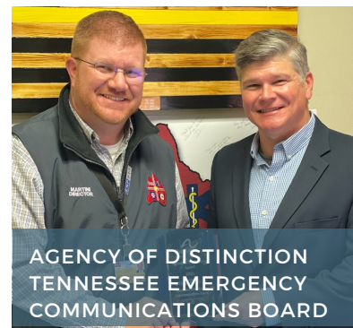
AGENCY OF DISTINCTION TENNESSEE EMERGENCY COMMUNICATIONS BOARD