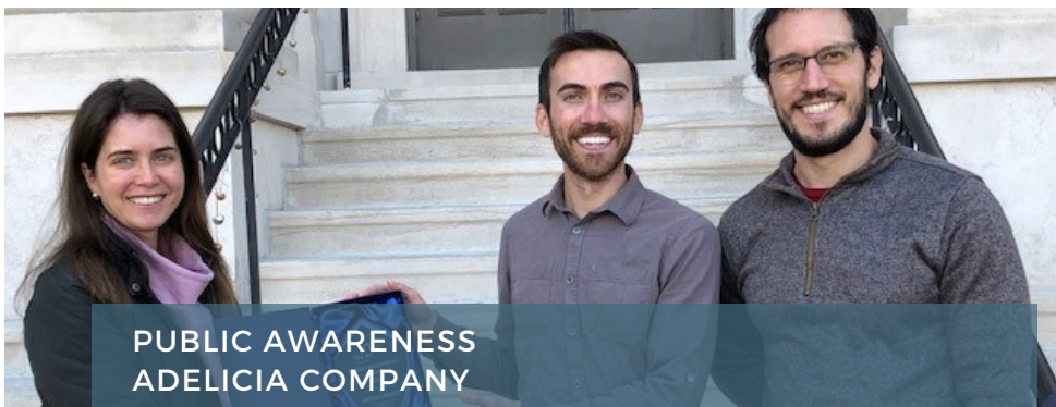
PUBLIC AWARENESS ADELICIA COMPANY