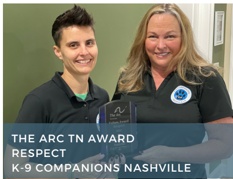
THE ARC TN AWARD RESPECT K-9 COMPANIONS NASHVILLE